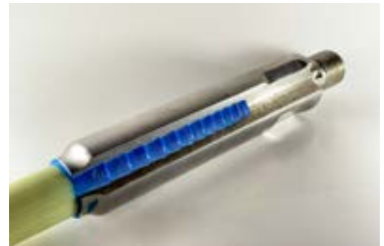
Fiberglass Sucker Rod showing cutaway of an Endurance Lift Solutions patented, industry leading end fitting.