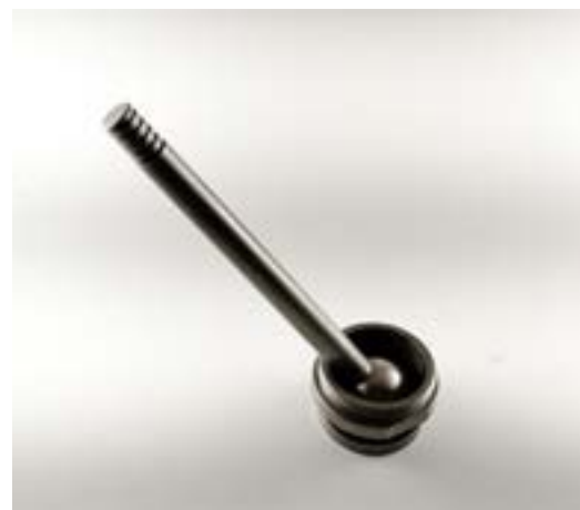
BLAZE treated trim kit.

- E&P Customer Partner Located in the Barnett Shale