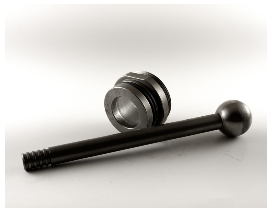
Blaze treated trim kit.