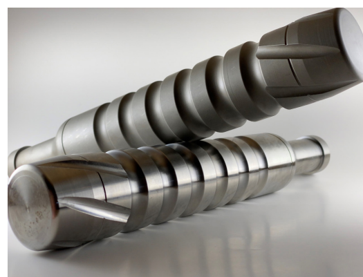
BLAZE treated barstock (top) with a non-treated barstock (bottom).