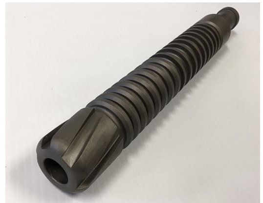
Blaze treated barstock.