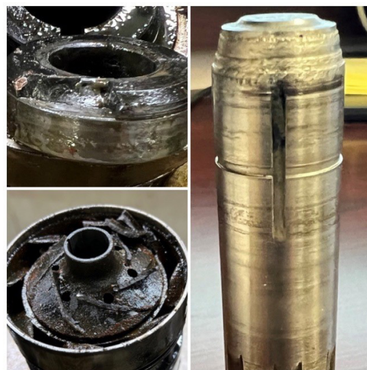
Top Left: Broken TC bearing from top pump. Bottom Left: Damaged stage in top pump. Right: Cut shaft.