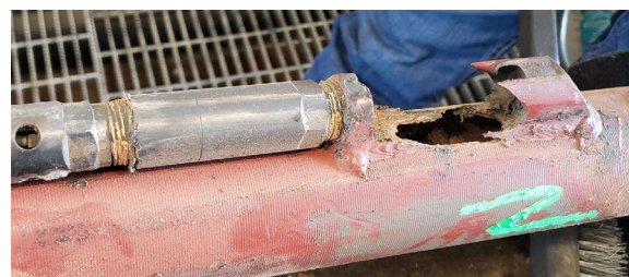
Conventional GL Mandrel showing corrosion-erosion of the Lug/GLV port after 6 month run time.