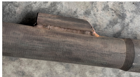
BLAZE treated GL Mandrel showing no corrosion-erosion of the Lug/GLV port after 8.5 month run time.