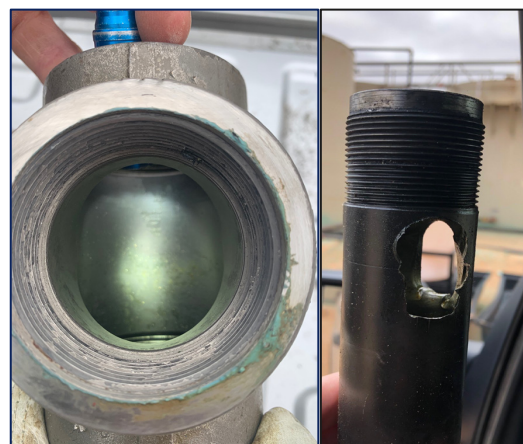
Left: Blaze treated Tee after December 2020 inspection. Right: Damaged cage during December 2020 offset frac.