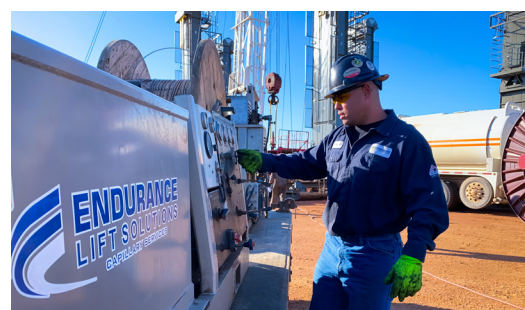
Endurance capillary technician on location for install.